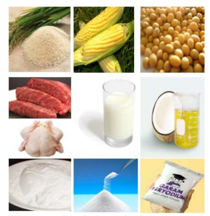
Fig.1. Nine primary commodities in Indonesia.

Rice is popular as a main source of carbohydrate. More than eighty percent Indonesian people eat rice daily though they have others sources of carbohydrates such as potatoes, bread, etc. It is almost un-substitutable source of carbohydrate. Only in an extreme condition, when rice hardly to find such as in a situation of disaster, flooding, etc then Indonesian people would like to consume another source of carbohydrate. Rice can also be used as raw materials in food industries such as rice noodle industry or as glue in textile industries.